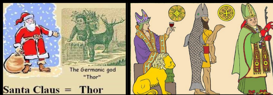
Santa Claus = Thor

"Nimrod started the great organized worldly apostasy from God that has dominated this world until now. Nimrod married his own mother, whose name was Semiramis. After Nimrod's death, his so-called mother-wife, Semiramis, propagated the evil doctrine of the survival of Nimrod as a spirit being. She claimed a full grown evergreen tree sprang overnight from a dead tree stump, which symbolized the springing forth unto new life of the dead Nimrod. On each anniversary of his birth, she claimed, Nimrod would visit the evergreen tree and leave gifts upon it. December 25th, was the birthday of Nimrod. This is the real origin of the Christmas tree."