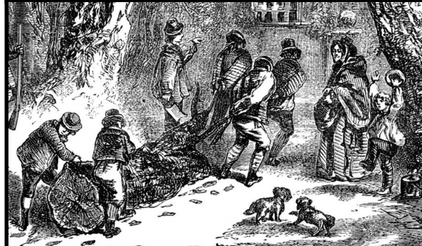
THE YULE LOG

Slaves were brought and given away as gifts from one slave master to the next. Slaves were made to carry Christmas trees, and yule logs, along with keeping the house "Merry" with entertainment.