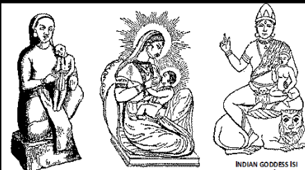
BABYLONIAN GODDESS SEMIRAMIS AND GOD-INCARNATE SON